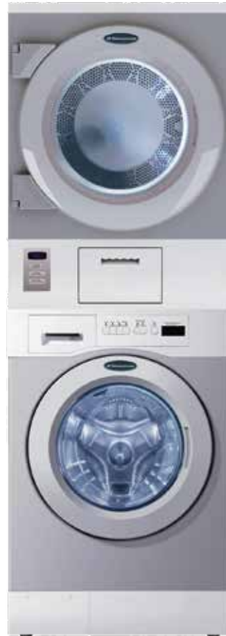
CROSSOVER WASHER/DRYER STACK