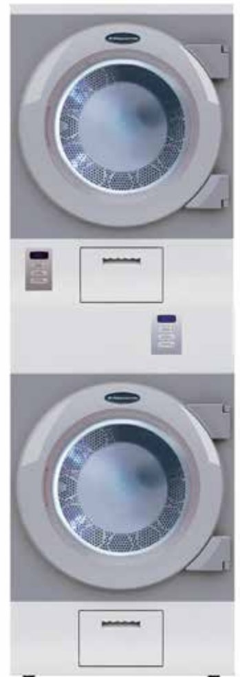
CROSSOVER DRYER/DRYER STACK